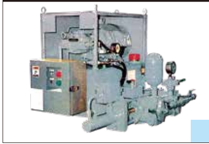
PA - 3H