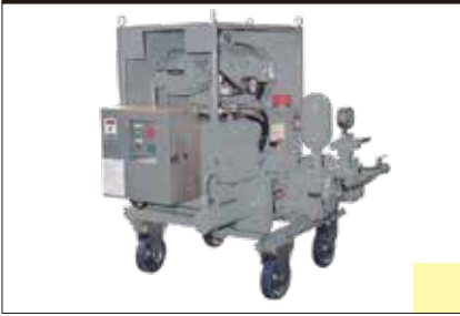
PA - 3