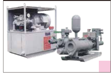
PA - 5