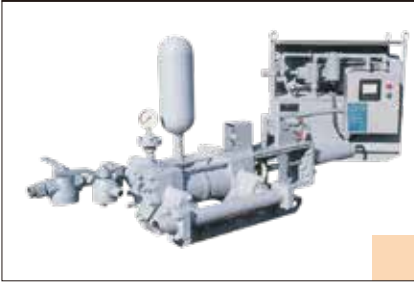
PA - 10