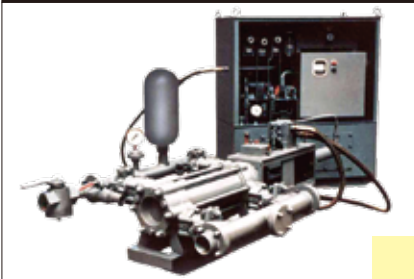
PA - 30C